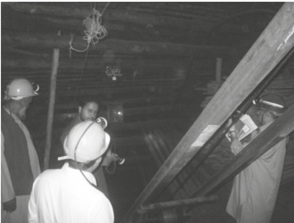
Mission members speak to mine workers at a coal mine in the Sor Range

Most other mines in the province, however, do not have such facilities available for miners. Lack of protective gear, medical facilities, ambulances and hospitals make the work hazardous. Most miners are not local and come from Khyber-Pakhtunkhwa to find work. As a result, they have no local support base. They work on a contract basis and lack job security. Although miners are supposed to work no longer than eight-hour shifts, they are not stopped from working 10–12 hours a day. Working conditions are grim: little attention is given to health or safety, nor is clean drinking water and quality food provided.