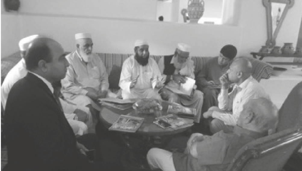
The mission meeting labour union members

The labour union representatives that met HRCP's mission said that 62 unions had been banned. They believe this infringes on their fundamental right to association. In several areas, such as the mines in Saindak in Chaghi District, workers are not allowed to form labour unions. Labour leaders believe that unions are disallowed, or at the very least discouraged, in areas where foreigners are involved. They also claim that any labour demonstrations they might try and organize to highlight their concerns are actively disrupted by the FC or other LEAs.