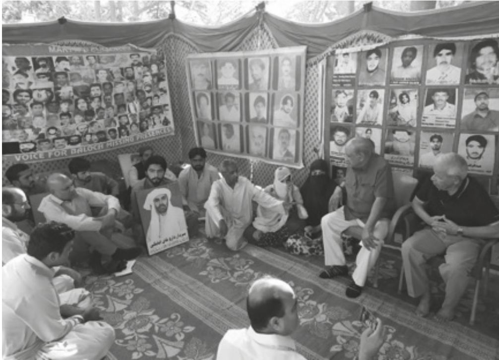
HRCP's mission members listen to victims' families at the missing persons camp in Quetta

The duration of an enforced disappearance varies. In many cases, people have been missing for years – in some instances, for up to 18 years. It is worth noting that the Commission of Inquiry on Enforced Disappearances, which issues a monthly press release and records brief details of the number of cases pending before the Commission as well as missing persons that have been recovered, claims that Balochistan has the least number of missing persons (at the time of writing this report).