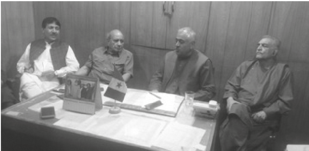
HRCP's mission met representatives of the PkMAP

The HRCP mission met a number of political party representatives in Quetta and Makran, including the Awami National Party (ANP), Balochistan National Party (Mengal) (BNP-M), Hazara Democratic Party (HDP), National Party (NP), Pakhtunkhwa Milli Awami Party (PkMAP), Pakistan National Party (Awami), Pakistan People's Party (PPP) and Pakistan Muslim League (Nawaz) (PML-N). The consensus appeared to be that Balochistan's political climate had deteriorated. Party representatives felt that the 2018 general elections were marked by fear and rampant horse-trading. Almost all the political parties HRCP consulted had reservations concerning the democratic credentials of the current provincial government, including allegations of the security apparatus being used against democratic forces and the elections having been manipulated in favour of candidates with 'pro-establishment' credentials.