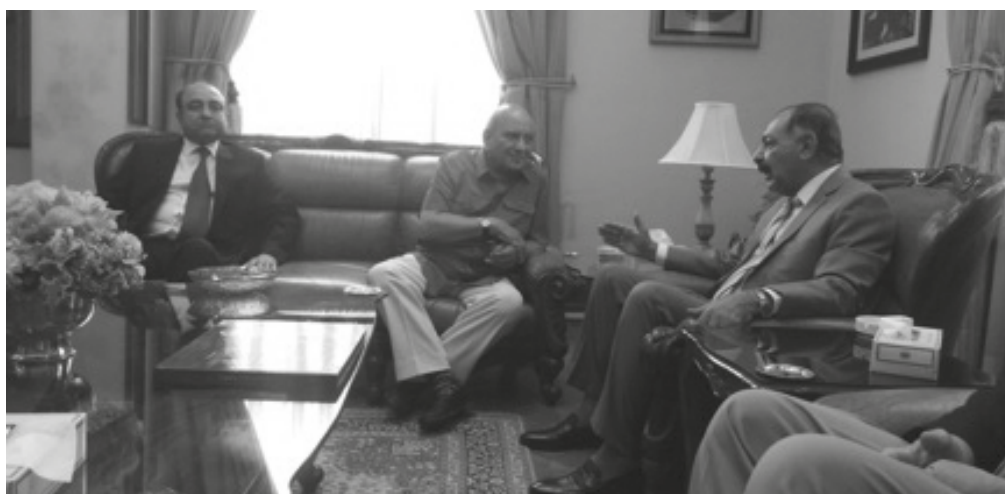
HRCP's mission meets the Governor of Balochistan, Amanullah Khan Yasinzai

The mission briefly discussed the impact of CPEC on Balochistan. The Governor observed that the pace of work on projects related to CPEC would soon gain momentum and that the people of Balochistan – in particular, its youth – would benefit from the ensuing job opportunities. While discussing the issues faced by the agricultural sector, the Governor told the mission that the federal and provincial governments were considering building more small dams in the province to help farmers.