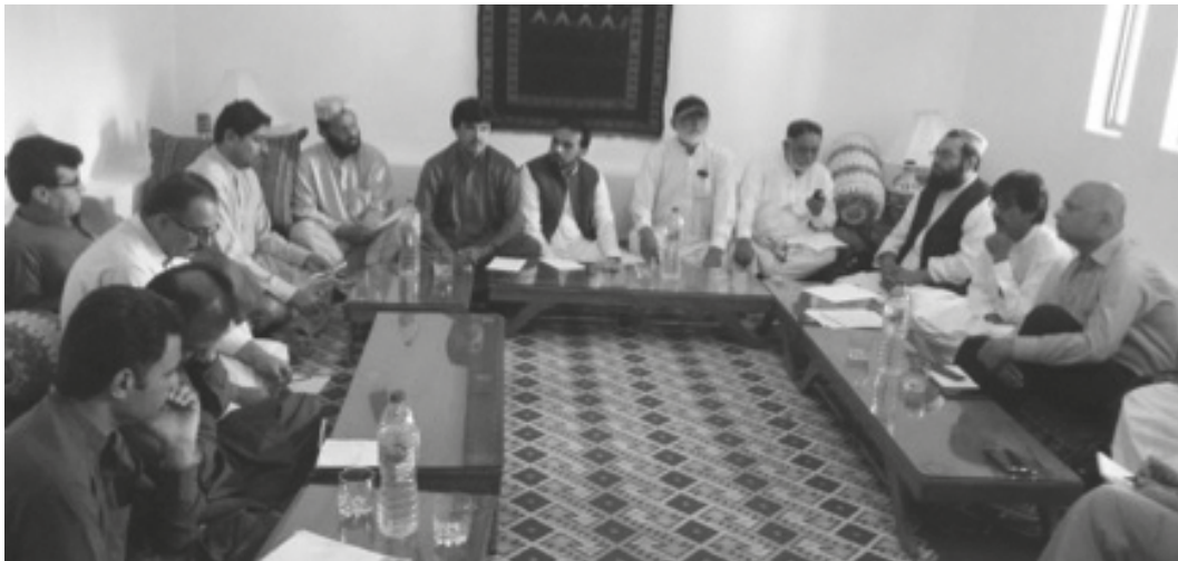
The fact-finding mission meets HRCP-trained human rights defenders from different districts of Balochistan