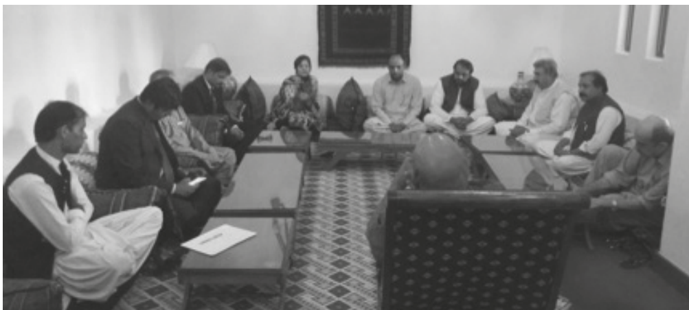
HRCP's mission meets members of civil society in Quetta

Civil society organizations (CSOs) that met the mission said there was an increase in pressure not to work on human rights issues in the province. Intelligence personnel visit CSO offices regularly and demand to see documents related to their staff and the projects they are working on – such visits have become more frequent in recent years. Meanwhile, the process of registration for new CSOs has been made very complicated to the extent of discouraging them from registering at all.