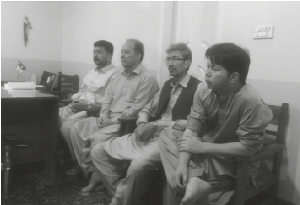
Members of the Shia Hazara community express their concerns to the mission

A primary concern expressed at this meeting was the lack of follow-up with, and support for, the families of victims of sectarian or terrorist attacks against the community. While victims' families are assured they will receive compensation as announced by the government, they say this is sporadic at best. The Hazara community has constantly urged the state, the provincial government and civil society organizations to support victims' families. The HDP demands that a commission be set up to focus on this issue.